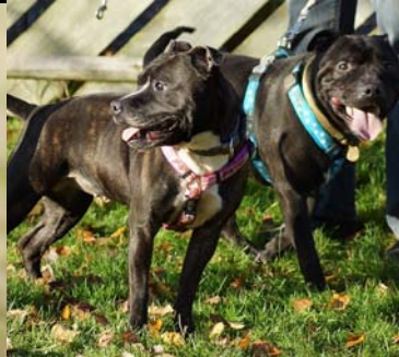
Dixie & Simon